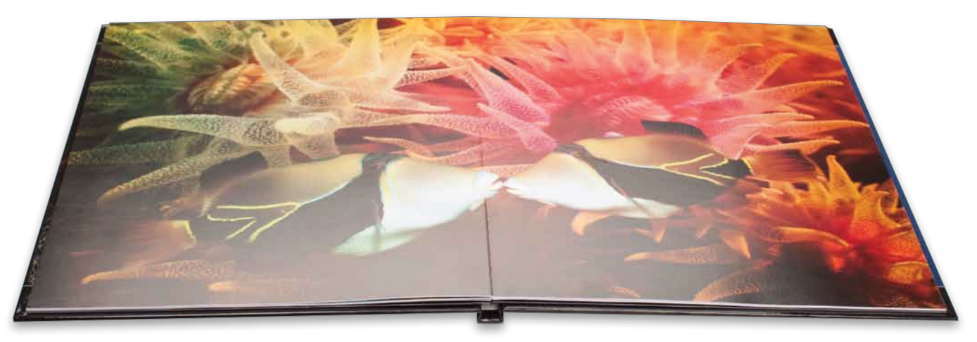
High quality crease even on photographic prints