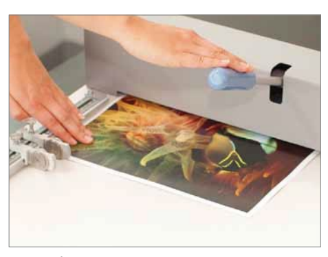
Handle lifts and creases easily and consistently.